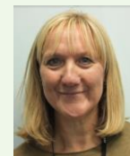
Pamela Johnson Nursery

Toddler group Wednesday's 9.15 – 10.45 Toddler singing group Thursday's 9.15 singing and music starts from 9.50- 10.15 then stay for a play and a coffee after.