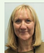
Pamela Johnson Nursery

Toddler group is finished for the holidays but back in September Wednesdays 9.15 – 10.45